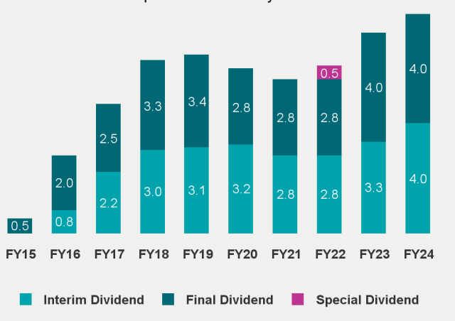
DIVIDENDS IN CENTS PER SHARE Annual dividend yield: 6.8% Grossed up annual dividend yield: 9.7%

Yield is calculated based on the total dividends of 0.8 cents per share and the closing share price of $1.180 as at 30 November 2024. Grossed up yield takes into account franking credits at a tax rate of 30%.